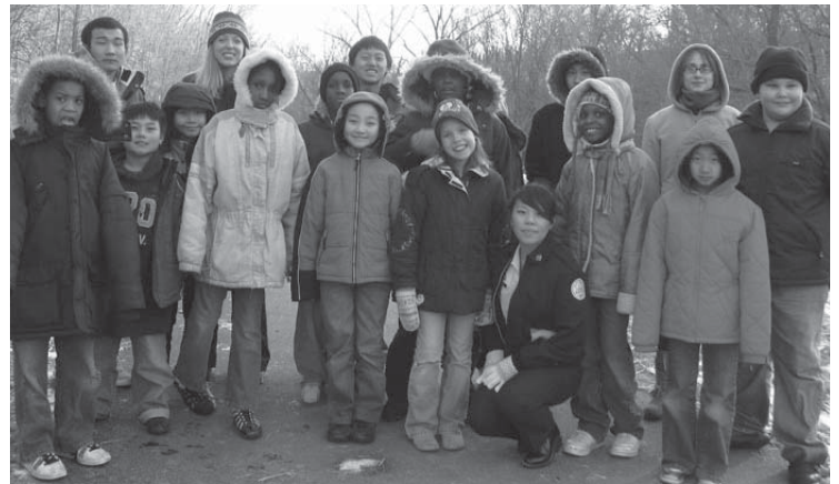
Nature in the Neighborhood students visit Swede Hollow Park!

Four talented teen interns from our summer Conservation Corps participate as Peer Educators for Nature in the Neighborhood classes. Peer Educators practice their teaching skills by leading small group activities, attending weekly trainings, creating lesson plans, and sometimes even instructing the whole class! We are also very thankful to have Karrey Locher, our spring intern from Metro State University, helping with classes!