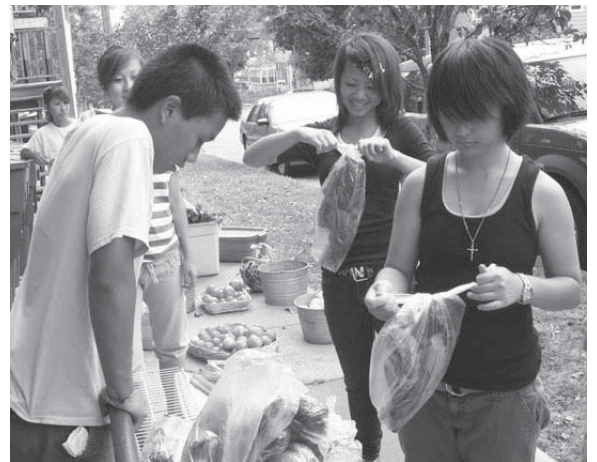
Teen interns prepare produce for Salad Share members

Our youth interns will practice their entrepreneurial skills again on Saturday mornings this summer, selling garden-fresh produce, herbs, and flowers. Schedule and location details will be available by late May on our website. www.comdesignctrmn.org