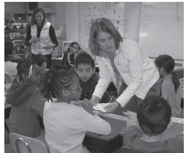
4th grade nutrition class